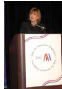
Western Union CEO Christina Gold

2006 by Fortune magazine as one of America's 50 Most Powerful Women in Business.